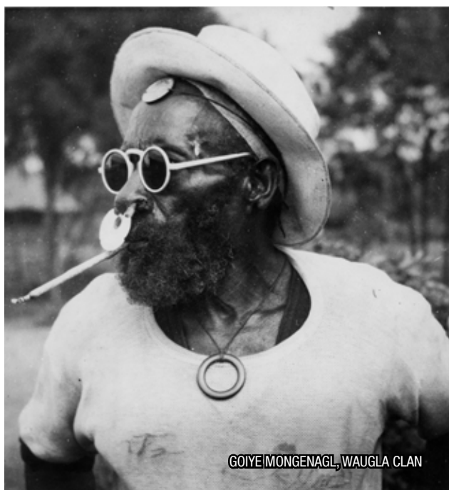
GOIYEIMONGENAGL, WAUGLA CLAN