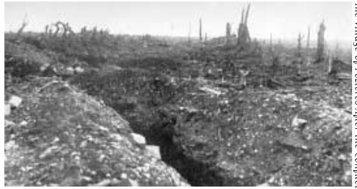
The Village of Pozieres After the Conflict