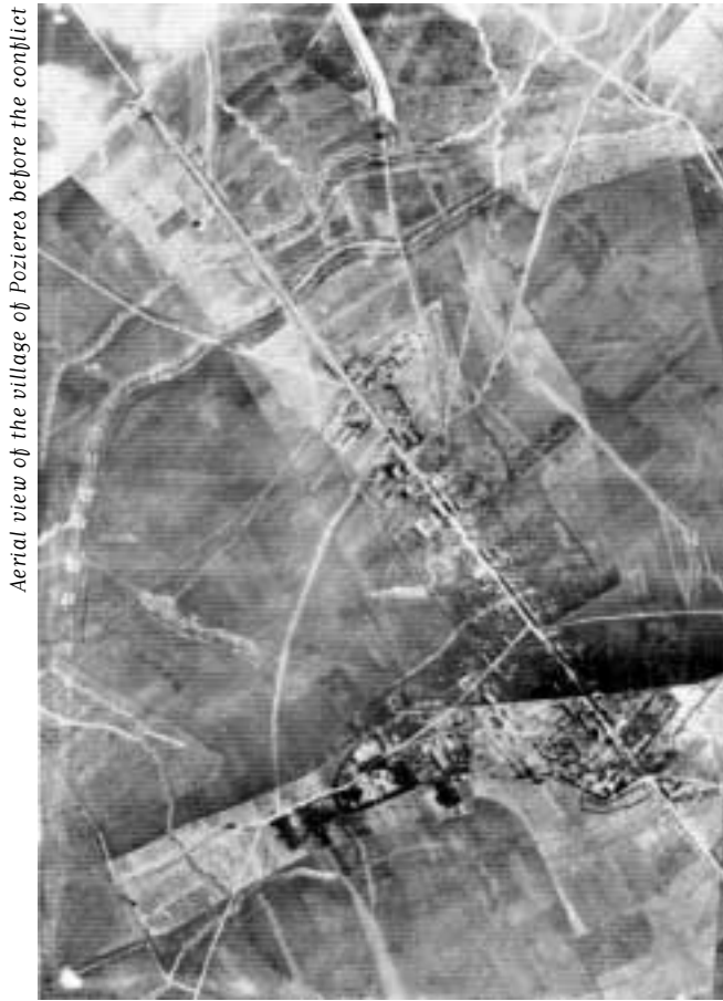
Aerial view of the village of Pozieres before the conflict