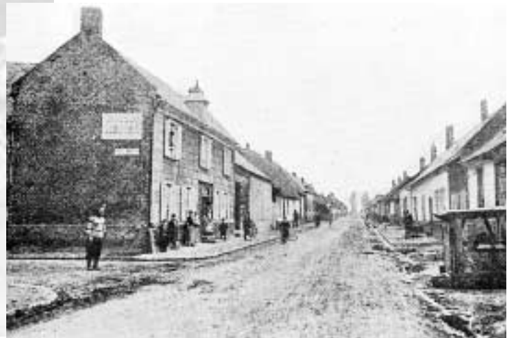
The Village of Pozières Before the Conflict

In 1915, one million tons of British ships were sunk by German submarines and the German army used poison gas as a weapon for the first time in the history of warfare. In 1916, the Germans launched the drive towards Paris along the Somme River Valley in a series of battles that was to include the Battle of Pozières.