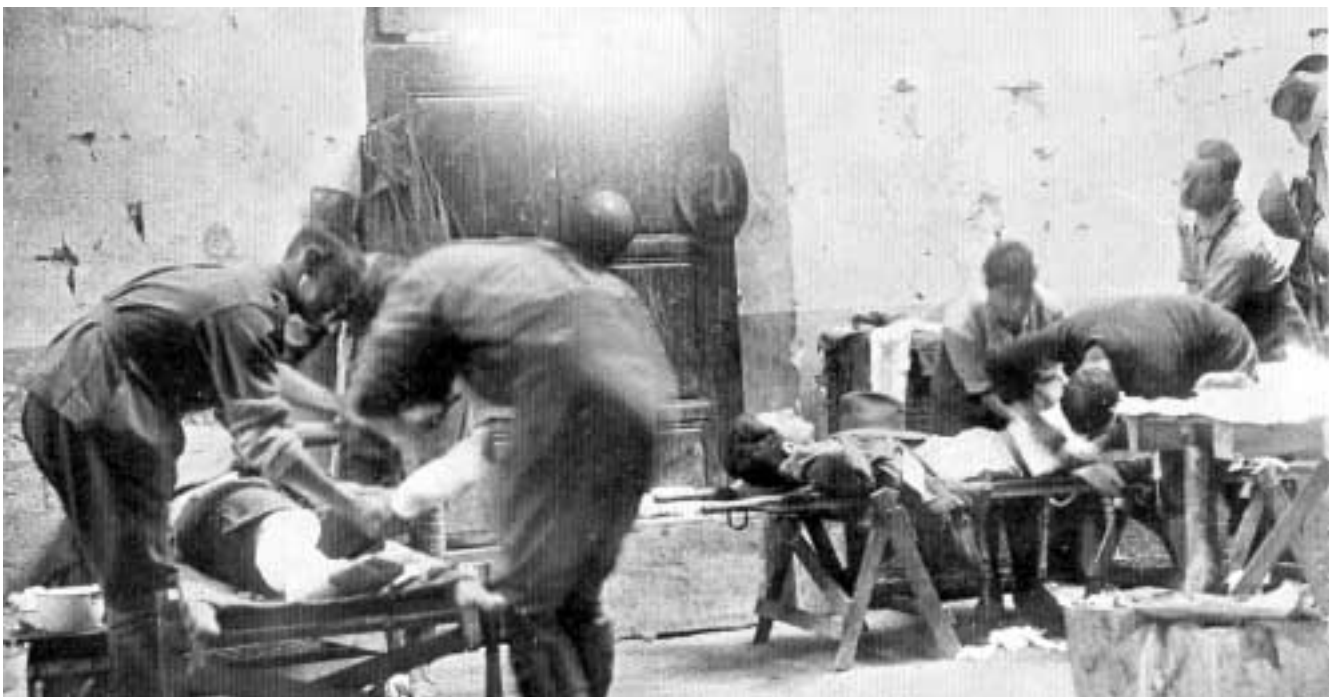
Dressing station near Pozieres