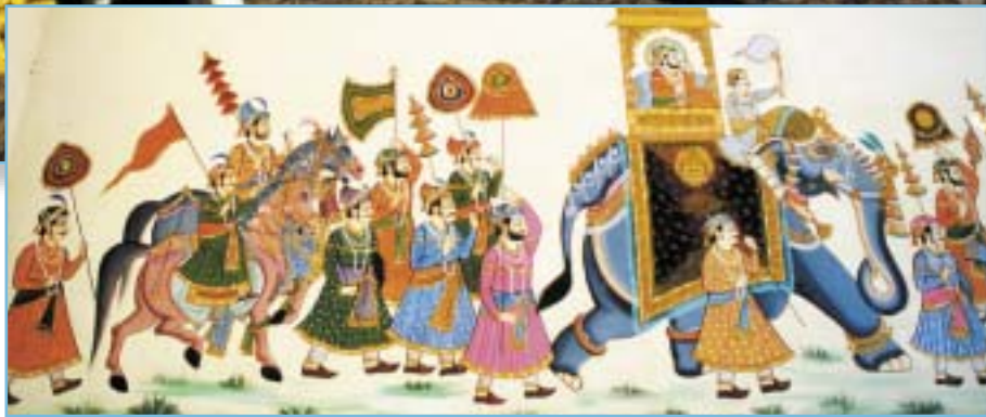
ABOVE TOP: Shriji Arvind Singh Mewar learning to fly - For time out Shriji Arvind Singh Mewar takes flying lessons. He had an airstrip built near his family's old hunting lodge and he allows himself a one-hour lesson most afternoons; BOTTOM TWO: Wall paintings from one of the Udaipur palaces - Exquisite wall paintings at one of Shriji Arvind Singh Mewar's palaces in Udaipur;