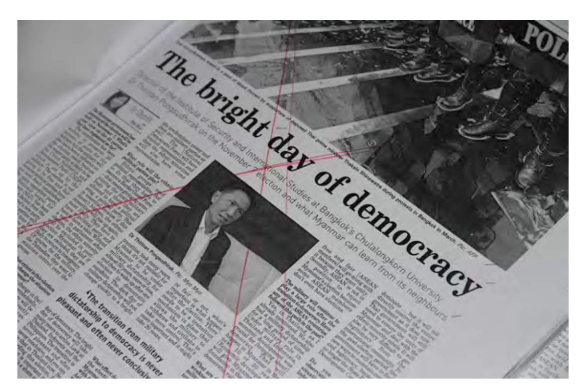
The Myanmar Times copy censored by Press Scrutiny Board 2010