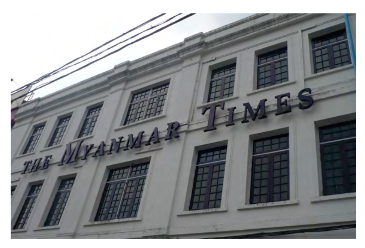
The Myanmar Times office -Yangon