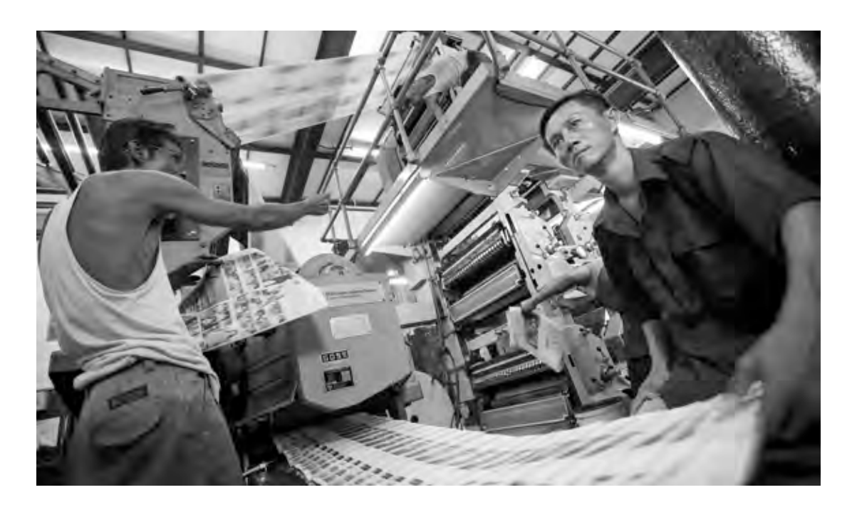
Printing The Myanmar Times in Yangon

arrest, the NLD won in a landslide with 90% of the vote. The army simply ignored the result and took back power.