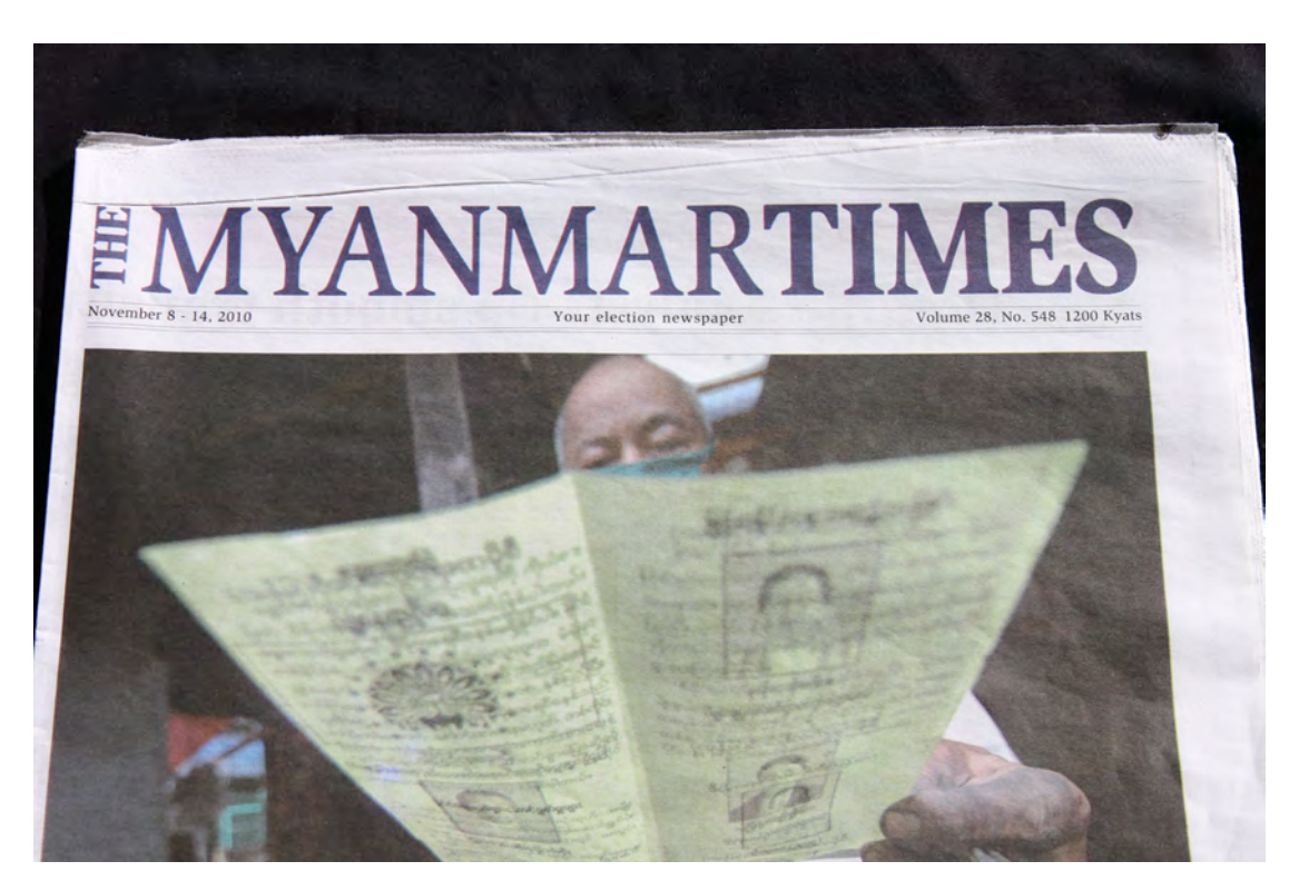
The Myanmar Times - Front page