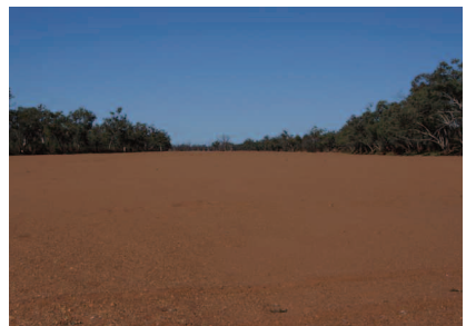
A SCENIC SHOT FROM 'EIGHT LADIES'