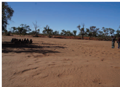
EIGHT LADIES BEING FILMED BY NICOLA DALEY AND DENA CURTIS