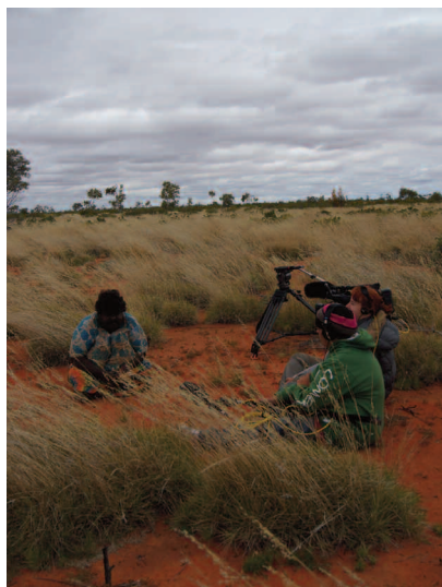
JEANNIE PULA BEING INTERVIEWED