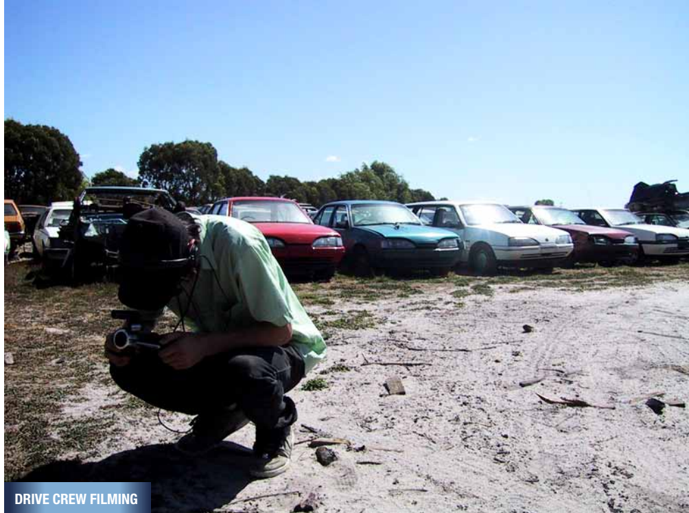
DRIVE CREW FILMING