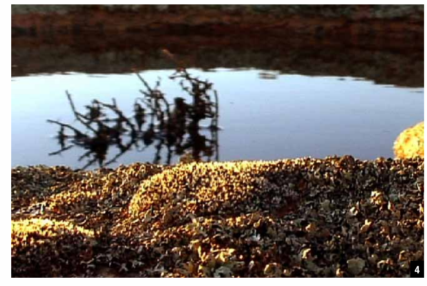
1&4: Near the sacred Dinah Rockhole 2: Sue razor fishing at Denial Bay 3: Full moon near Dinah Rockhole