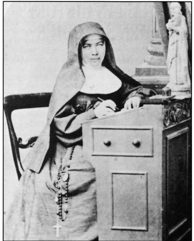
Mary MacKillop in the year of her excommunication (1871) at the age of 29