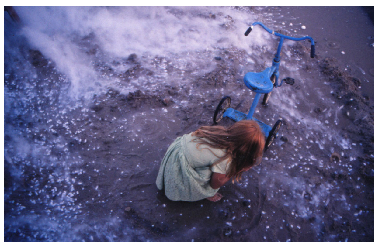
She wondered what a nuclear winter might look like. The Child, Shadow Panic (Nash 1989)