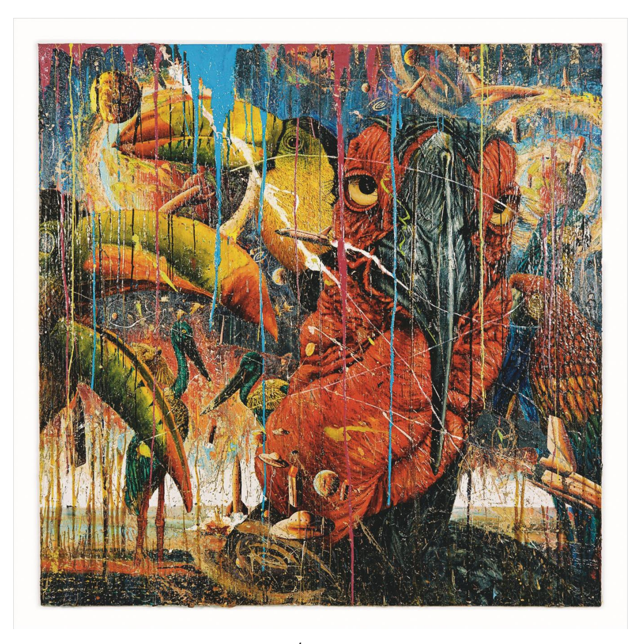
Space/Rain Forest