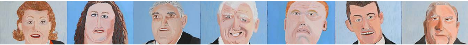
The Richest by Ramsay Art Prize Finalist Vincent Namatjira

Learning outcomes and content descriptors have not been developed for Arts subjects in the Australian curriculum; however, the ideas explored in the series could be linked to the key knowledge and skills in Senior Art throughout Australia.