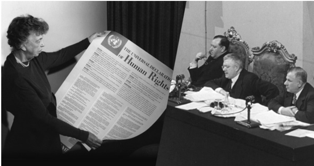
Eleanor Roosevelt and the Universal Declaration of Human Rights, "Doc" Evatt at the UN, 1948

According to The Hon. Micheal Kirby, who was a small boy at the time, all the school children of Australia received an aerogramme copy of the Declaration. Hard to imagine any of the politicians in our major parties today being part of anything so noble and important.