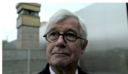
GERMANY_Julian Burnside at Berlin Wall.JPG