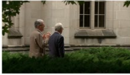
AUSTRALIA_David Marr & Julian Burnside.png