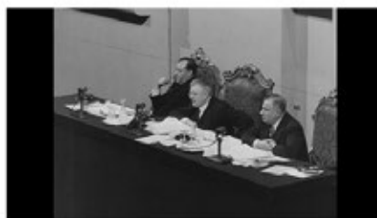
USA_Australian politician Doc Evatt at UN General Assembly 1948.png