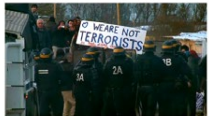
FRANCE_We are not terrorists refugees at Calais.jpg