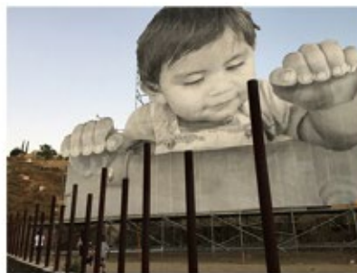
MEXICO_Giant Toddler by french artist JR at The Wall_.JPG