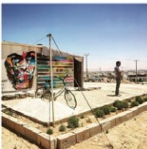
JORDAN_Adel's Container hom at_Zaatari Refugee Camp.jpg