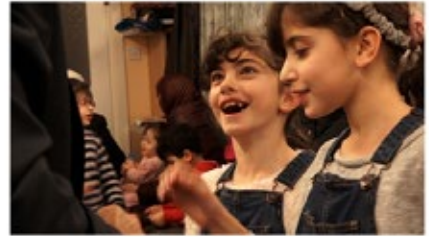
BUTE_Syrian children laugh.png