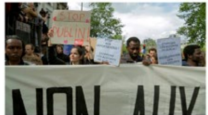
FRANCE_Protesters at May Day march Paris.png