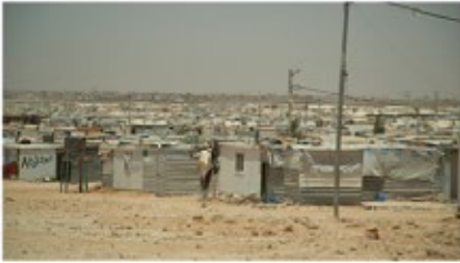
JORDAN_Zaatari Refugee Camp.jpg