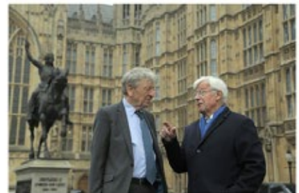
UK_Lto R_ Lord Dubs and Julian Burnside at Houses of Parliament London.jpg