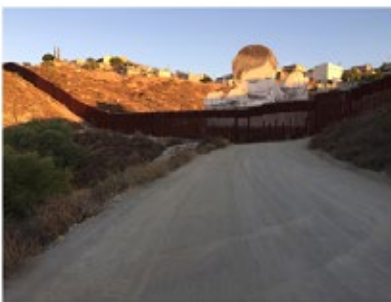
MEXICO_Giant Toddler by french artist JR at The Wall.JPG