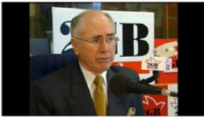
AUSTRALIA_Fmr PM John Howard.png