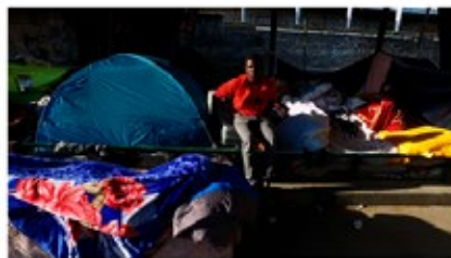
FRANCE_single refugee shelters under bridge at Port de la Chapelle_Paris.png