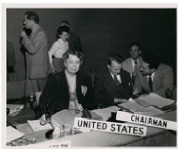
USA_Eleanor at UN.jpg