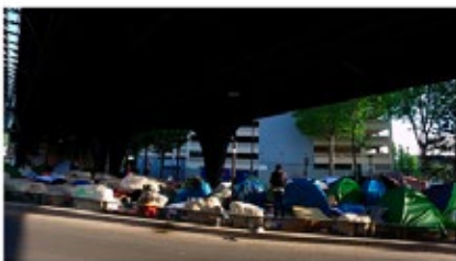
FRANCE_Refugees shelter under bridge at Port de la Chapelle_Paris.png