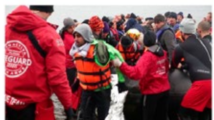
GREECE_citizens rescue Syrian refugees.png