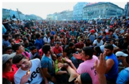
SYRIA_refugees wait in city square.jpg