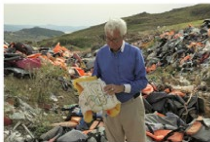
GREECE_Julian Burnside with child's lifejacket at 'Lifejacket graveyard'_LESVOS.JPG