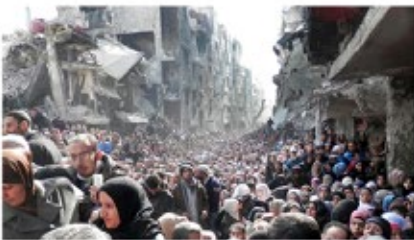
REFUGEES_Large crowd of refugees Syria.jpg