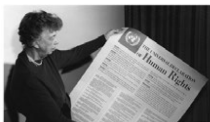
USA_Eleanor Roosevelt holds Universal Declaration of Human Rights 1948.jpg