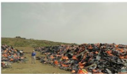
GREECE_Julian Burnside at 'Lifejacket graveyard'_LESVOS.JPG