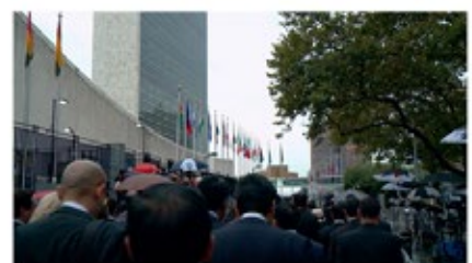
USA_exterior UN Summit for Refugees and Migrants NYC.png