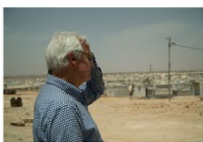
JORDAN_Julian Burnside at Zaatari Refugee Camp.jpg