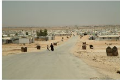
JORDAN_Zaatari Refugee Camp2.jpg