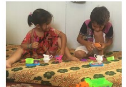
JORDAN_Adel's children at Zaateri Refugee Camp.JPG