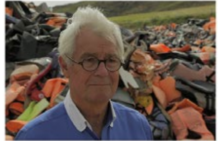
GREECE_Julian Burnside at 'Lifejacket graveyard'_2_LESVOS.JPG