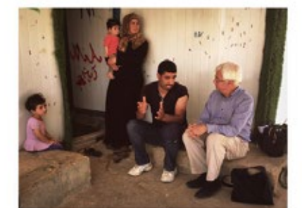
JORDAN_Julian Burnside and Syrian family at Zaatari Refugee Camp.jpg