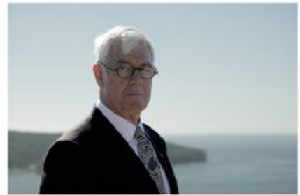
AUSTRALIA_Julian Burnside portrait at Sydney Harbour Headland.jpg