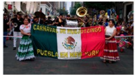
USA_Mexican Carnival in New York.png