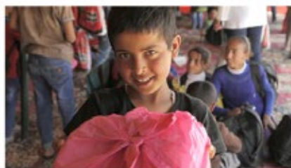
JORDAN_Child at Non-Formal Community near Syrian border.JPG