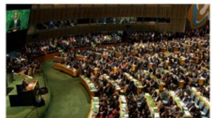
USA_Barak Obama at UN Summit on Refugees and Migrants.jpg