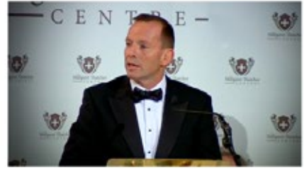
AUSTRALIA_Fmr PM Abbott delivers speech at Thatcher Centre.png