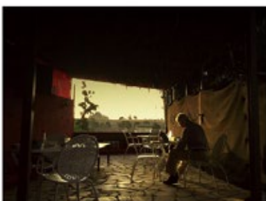
JORDAN_Julian Burnside in Aman.jpg