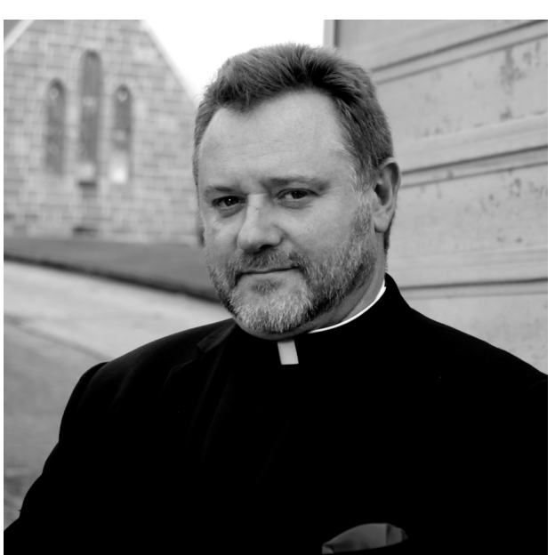
Table 1 on page 10 of this guide could be used by students as they watch the film to make notes about each of the different elements of the film. Altogether they create a narrative snapshot of the man and his convictions.

This film tells the story of Father Rod Bower and how he expresses his Christian beliefs in ways that are sometimes unconventional and even unpopular with those who do not see a Parish priest as someone who should express views some may see as 'political'. Others may see his work as integral to the message of love and compassion that is at the heart of the life of Jesus Christ.