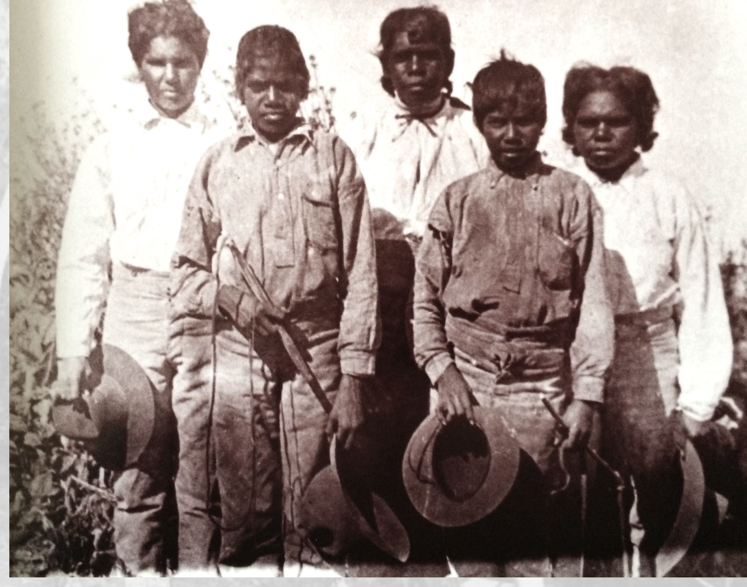
The Drover's Boy 11min 2014 ©Australian Film, Television and Radio School

Based on an original ballad by and featuring TED EGAN