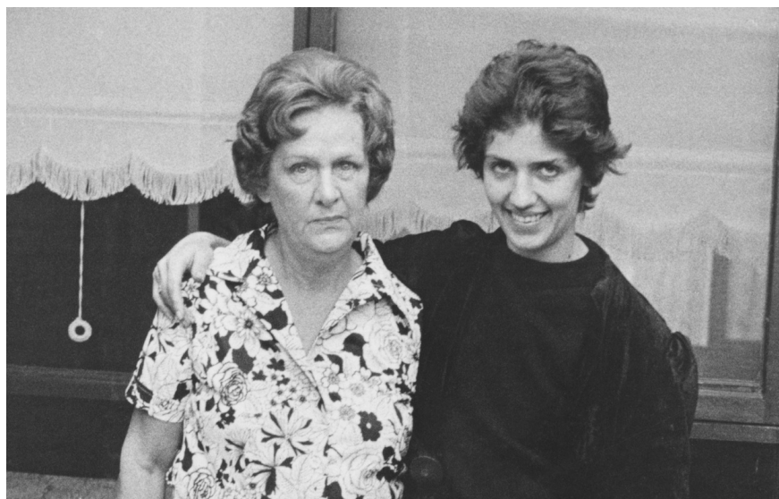
Our Mum's and Us Series 1976