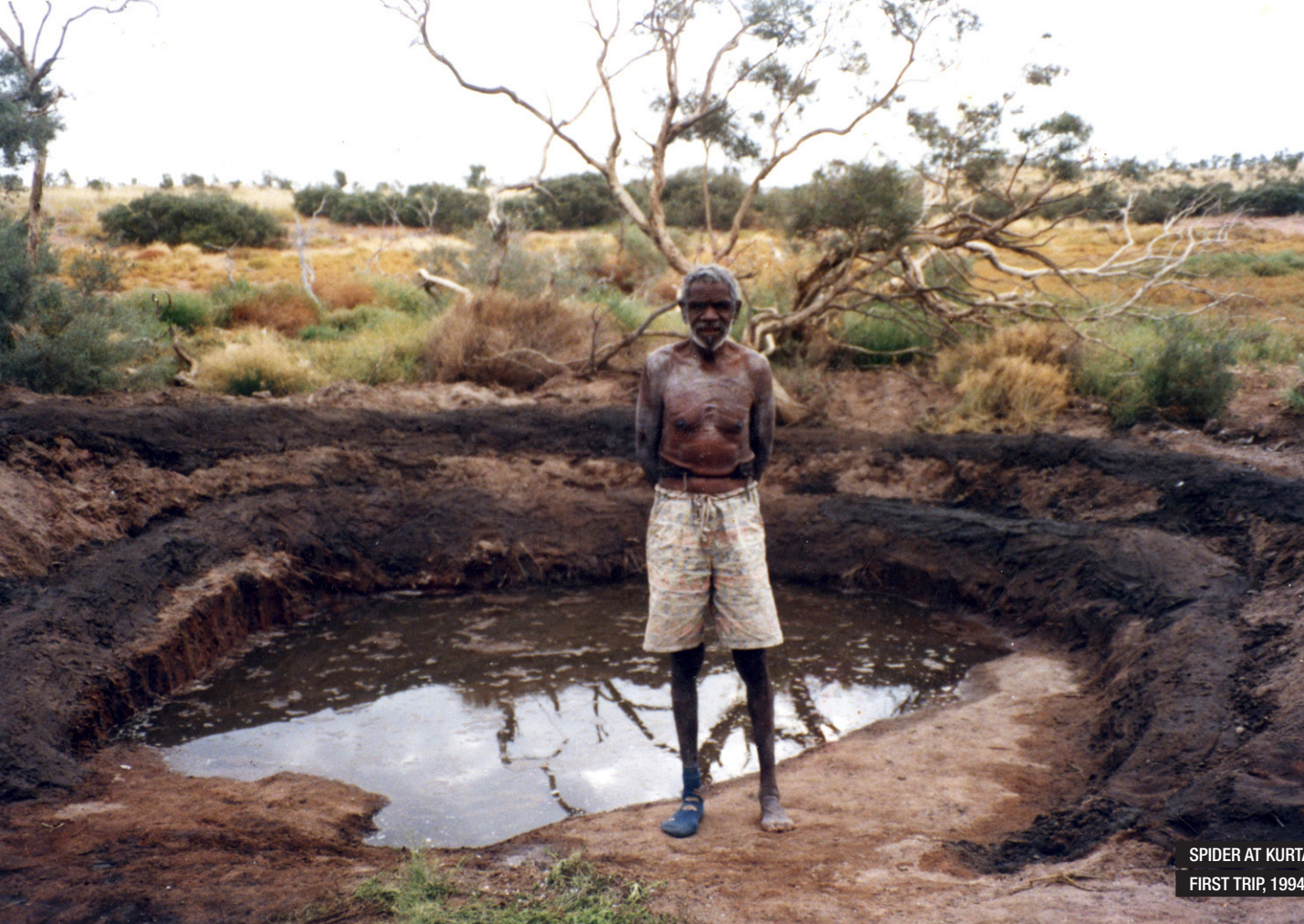
SPIDER AT KURTAL, FIRST TRIP, 1994