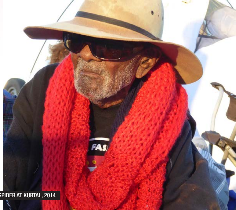
SPIDER AT KURTAL, 2014