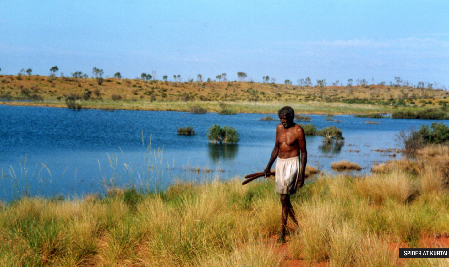
SPIDER AT KURTAL, 2002