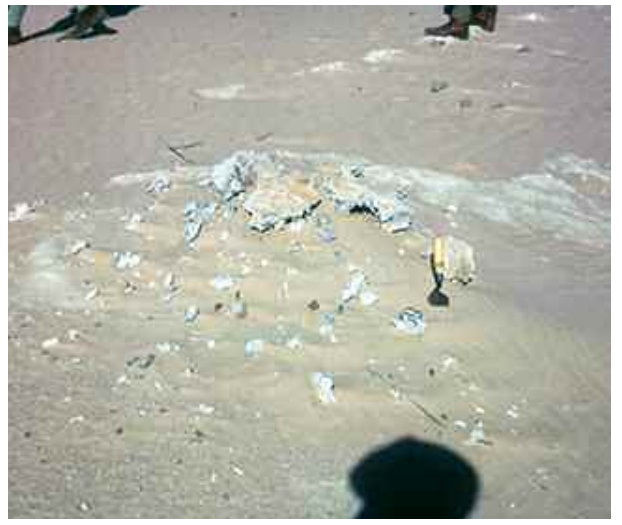
Mungo cremation as found 1969