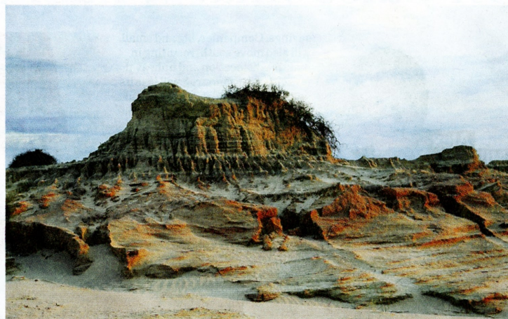
Landscape wonders: Unusual silcrete formations on the “Walls of China” at Lake Mungo.